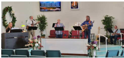
Mt Carmel Community Church